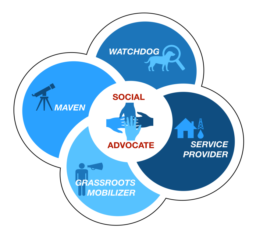
FIGURE 3. CSA - SHARED SOCIAL ADVOCATE FUNCTION FOR DIVERSE CSO ROLES